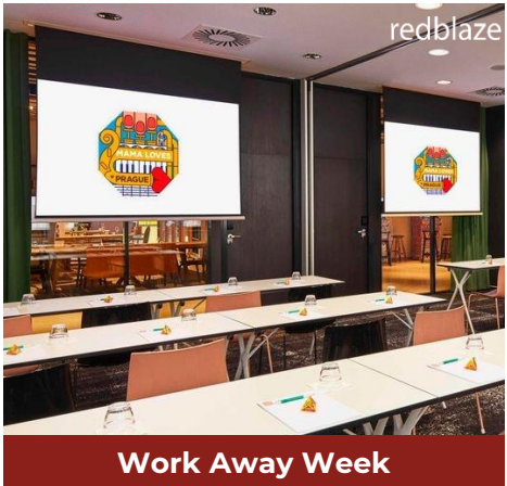
Work Away Week