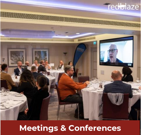
Meetings & Conferences