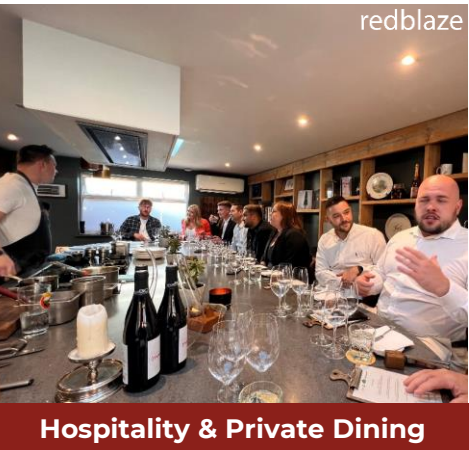
Hospitality & Private Dining