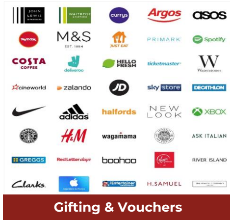
Gifting & Vouchers