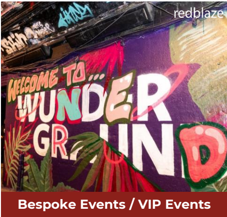
Bespoke Events / VIP Events