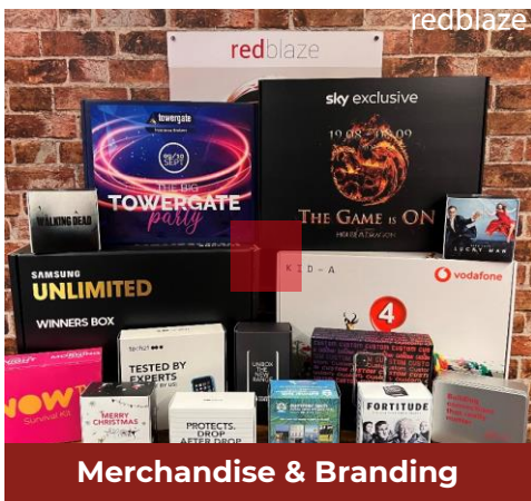
Merchandise & Branding