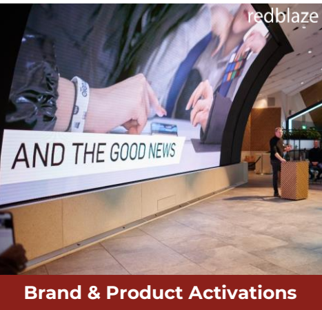
Brand & Product Activations